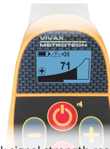
Peak signal strength response Field polarity indicator